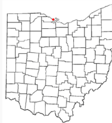
Location of Port Clinton, Ohio