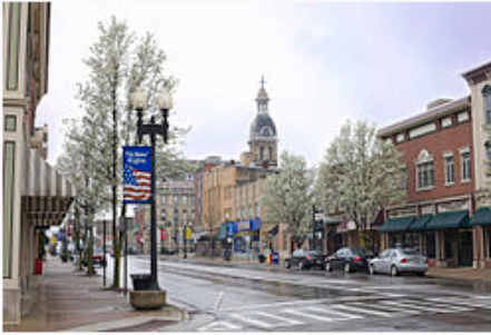
Downtown Wooster's East Liberty Street in April 2011