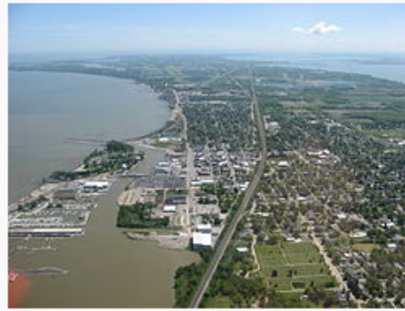
Downtown Port Clinton