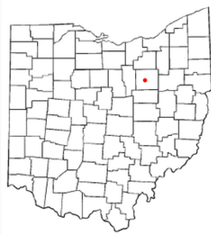
Location of Wooster, Ohio